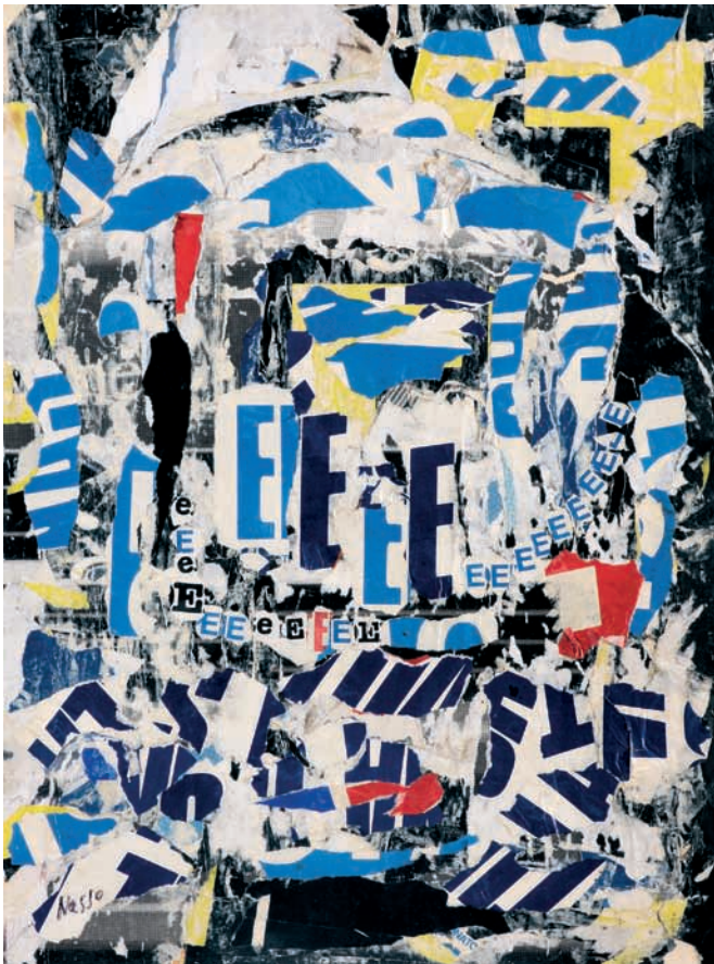
E... E... E... E... 1987, collage on plywood, 65x84 cm