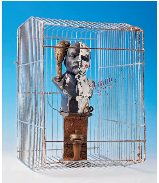
A Kiss on the Cheek for Lenin 1992, iron, 18x22x28 cm