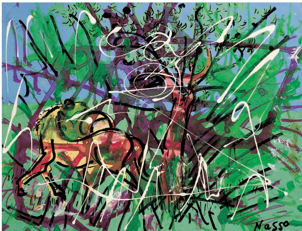
Enamel n. 5 enamel on paper